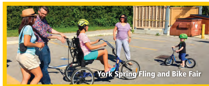
York Spring Fling and Bike Fair