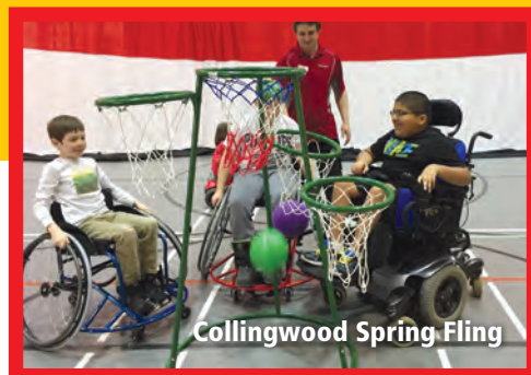
Collingwood Spring Fling