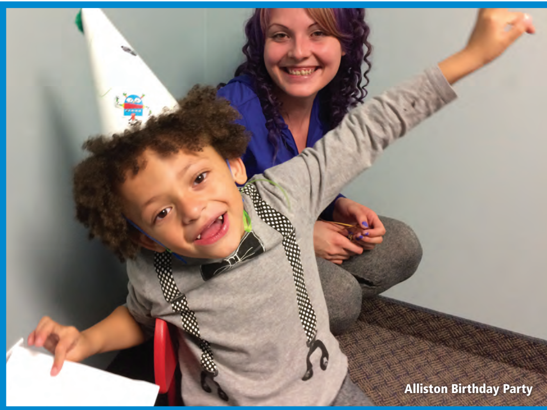
Alliston Birthday Party

CTN held the Family Series Events, to give children and youth opportunities for therapy in fun ways and to try adapted recreation equipment. Our Holiday events give families a chance to celebrate with other families, including our very popular Halloween Events with Trick-or-Treating at CTN local sites. Parent Education events are also popular, with topics including self-regulation, and tax information.