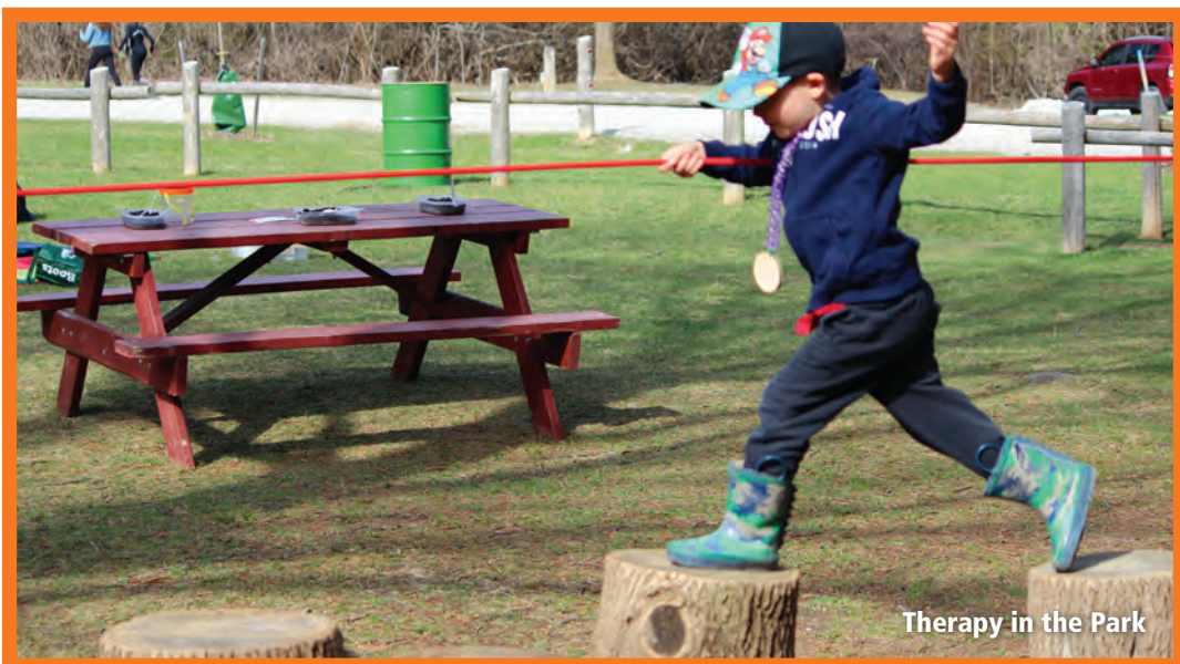
Therapy in the Park