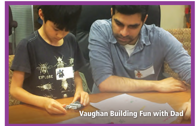
Vaughan Building Fun with Dad

CTN held the Family Series Events, to give children and youth opportunities for therapy in fun ways and to try adapted recreation equipment. Our Holiday events give families a chance to celebrate with other families, including our very popular Halloween Events with Trick-or-Treating at CTN local sites. Parent Education events are also popular, with topics including self-regulation, and tax information.